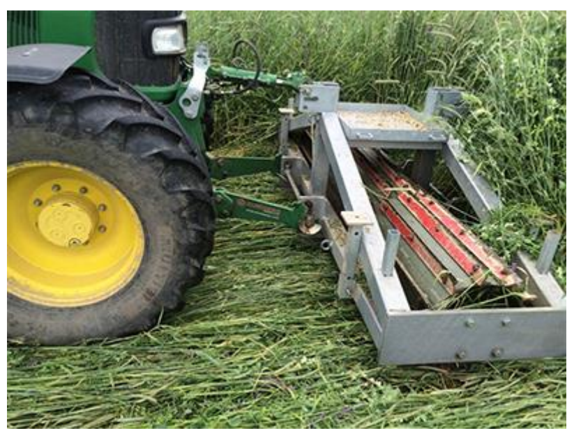
Roller-crimper in a rye-vetch cover crop-mixture; Photo: A. Grand

Soil fertility, cropping systems, nutrient-, humus balances, soil tillage, agroforestry, water household, knowledge transfer, local, indigenous, traditional ecological knowledge, farmers' experiments, innovation, regulatory framework, certification systems, home gardens, wild collections, ethno sciences, rural development, urban food / farming systems, organic farming and societal change, systems theory/ scenario technique, transfer approaches, transdisciplinarity, ethics, farming systems in the tropics.