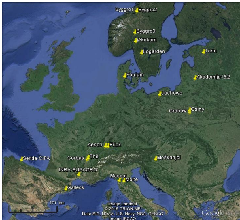
Distribution of field trials available for research within FertilCrop

FertilCrop is a network of scientists working in the areas of crop and weed science, soil sciences (soil physics, chemistry and biology), modelling and farm prototyping. Interactions of crops with weeds, soil macro- and micro-biota are a major focus of this project that builds on a large number of field trials (Figure 2, map). Another focus is to gather information on nutrient dynamics in soils and if or how they can be modelled in order to be predictable. FertilCrop will add to the existing knowledge by testing effects of reduced soil tillage in combination with other management options to build soil fertility and verify the clear distinction of their suitability along climatic gradients across Europe.