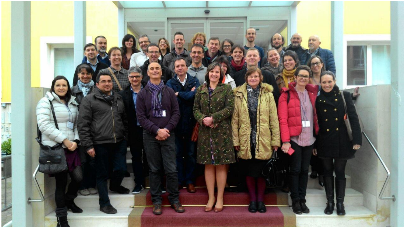
Kickoff meeting in Matera - 18/03/2015

ecological Service Crops exploitation will contribute to meet the increasing demand of innovation and to give to the European OFF sector a leading role in a global perspective".